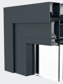
DOOR SASH CORNER